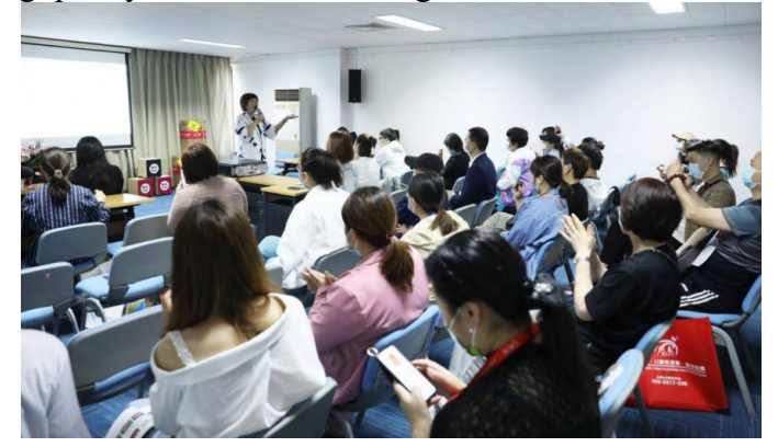
Figure 2 Music Education Seminar

The reform of education should first be carried out on a pilot basis in some places. The effects, advantages and disadvantages of the reform should be summarized in constant attempts, and a road beneficial to the country and the people should be explored in practice to promote the growth of music aesthetic education curriculum reform. In the teaching of music aesthetics, it is the key point of education and teaching to guide students to discover the beauty of music, excavate the aesthetic function of music, and promote students to grasp the aesthetic core of music. At the same time, it also puts forward higher requirements for teachers' teaching design. If the teachers can not improve the traditional teaching strategies, the students' understanding of music beauty will be greatly reduced and the teaching quality will be reduced. Figure 2 shows the music education seminar.